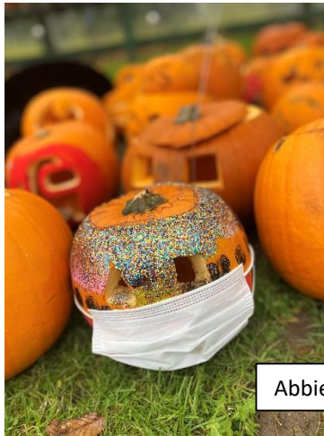
Abbie Team 1