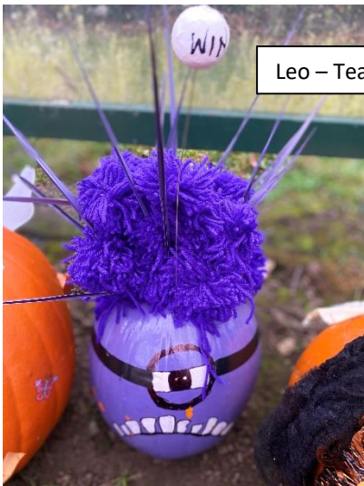
Leo - Team 2