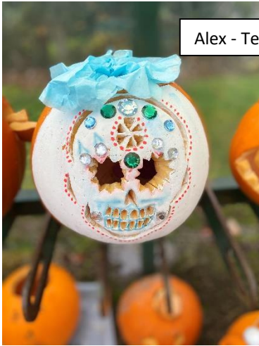
Alex - Team 2