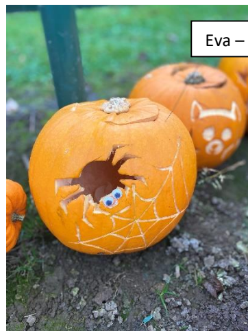
Eva - Team 1