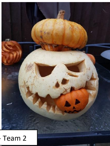
James - Team 2